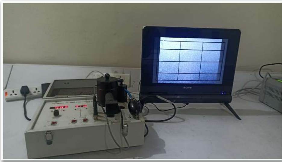
Milkan's Oil Drop experiment to measure the charge of electron