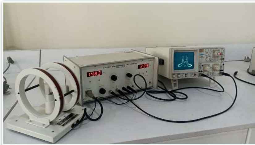
Electron Spin Resonance